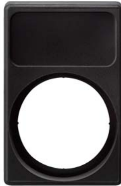
Label holder for labeling plate, Label size 9.5 x 18.5 mm,