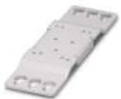
Universal wall adapter for securely mounting the power supply in the event of strong vibrations. The power supply is screwed directly onto the mounting surface. The universal wall adapter is attached at the top/bottom.

Assembly adapters - UWA 182/52 - 2938235