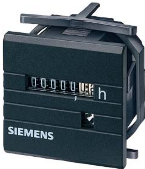
TIME COUNTER 48X48MM AC 115V 50HZ WITHOUT BLIND 55X55MM