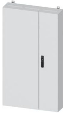
ALPHA 400, wall-mounted cabinet, Flat Pack, IP43, Protection class 1, H: 1400 mm, W: 800 mm, T: 210 mm, RAL 9016