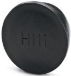
Plastic protection cap, antistatic, for connectors with M23 knurled nut

Please be informed that the data shown in this PDF Document is generated from our Online Catalog. Please find the complete data in the user's documentation. Our General Terms of Use for Downloads are valid ( http://phoenixcontact.com/download )