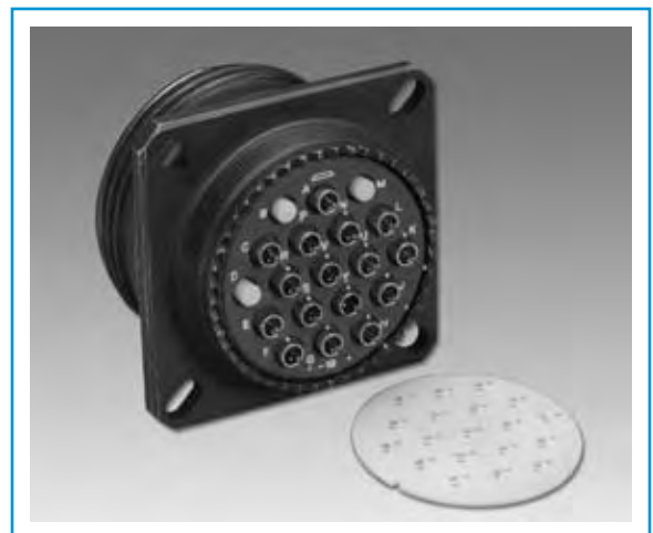
D38999 Connector with PC Tail Coax Contacts, Sealing Plugs in unused contact cavities and PC Tail Alignment Disc