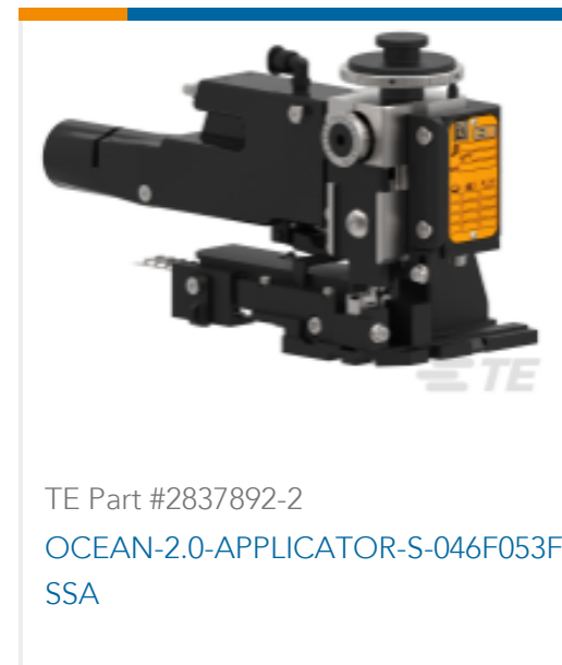
TE Part #2837892-2 OCEAN-2.0-APPLICATOR-S-046F053F- SSA