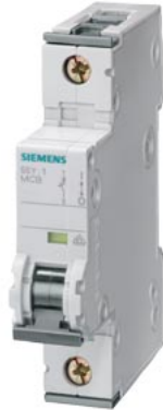
Miniature circuit breaker 230/400 V 6kA, 1-pole, B, 25A, D=70 mm