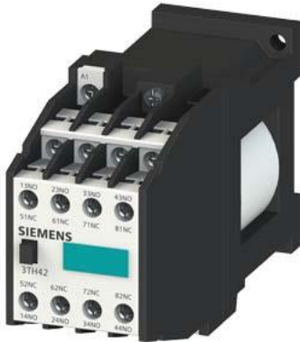
Contactor relay, 62E, DIN EN 50011, 6 NO + 2 NC, screw terminal DC operation 24 V DC