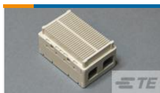
TE Part # 6-1761615-1 STEP-Z RCPT 11MM 200P LF ST