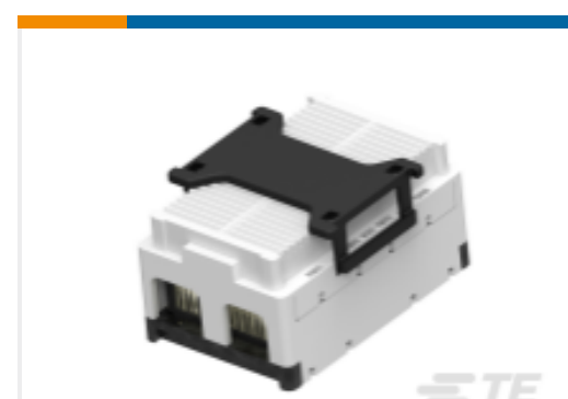
TE Part # 5-1761615-5 STEP-Z RCPT 05MM 200P LF ST