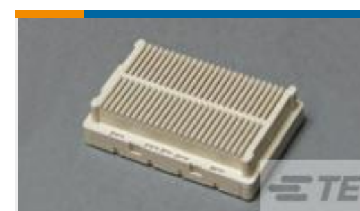
TE Part # 5-2007615-5 STEP-Z RCPT 05MM 200P LF HT