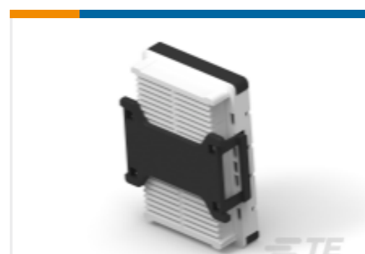
TE Part # 6-1761615-5 STEP-Z RCPT 15MM 200P LF ST