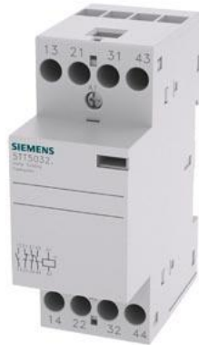
INSTA contactor with 2 NO contact and 2 NC contacts Contact for 230 V AC, 400V 25A Control 24 V AC