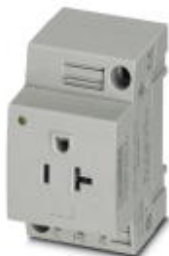
Socket, Typ: AB 20A, Light indicator, gray, for mounting on a DIN rail in the service interface or direct mounting, 125 V AC, 20 A, -20 °C, 60 °C, UL 508

Please be informed that the data shown in this PDF Document is generated from our Online Catalog. Please find the complete data in the user's documentation. Our General Terms of Use for Downloads are valid ( http://phoenixcontact.com/download )