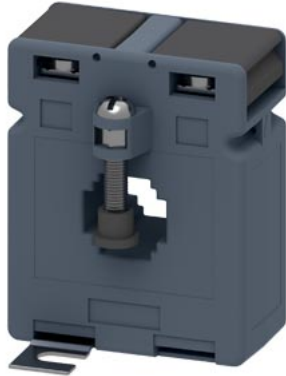
current transformer 400/5A 5VA CL 0.2s