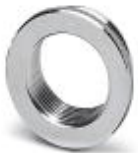
Step-down adapter, M25 to M20, including O-ring

Reducing adapter - REDUC-M-KV-M25/M20 - 1647624