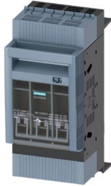
SENTRON, Fuse switch disconnecter 3NP1, 3-pole, NH000, 160 A, for 8US busbar system 60 mm, box terminal, Cover level 32/70 mm